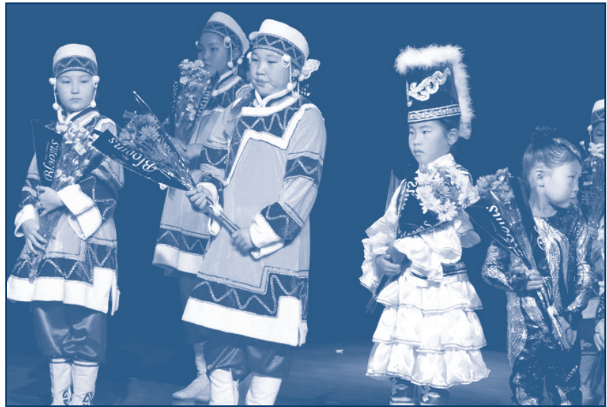
Children receive flowers after performing a traditional Mongolian dance.

Their situation here may be better, but still fraught with difficulty. According to a 2009 Asian Health Services study, 68 percent of their patient base does not speak English. The hardships that come with being new immigrants can also intensify mental health issues such as depression and anxiety, which they are not yet well-equipped to deal with. "Mental health is a new thing for us," Elma said. "People are stressed and depressed, but they feel alone