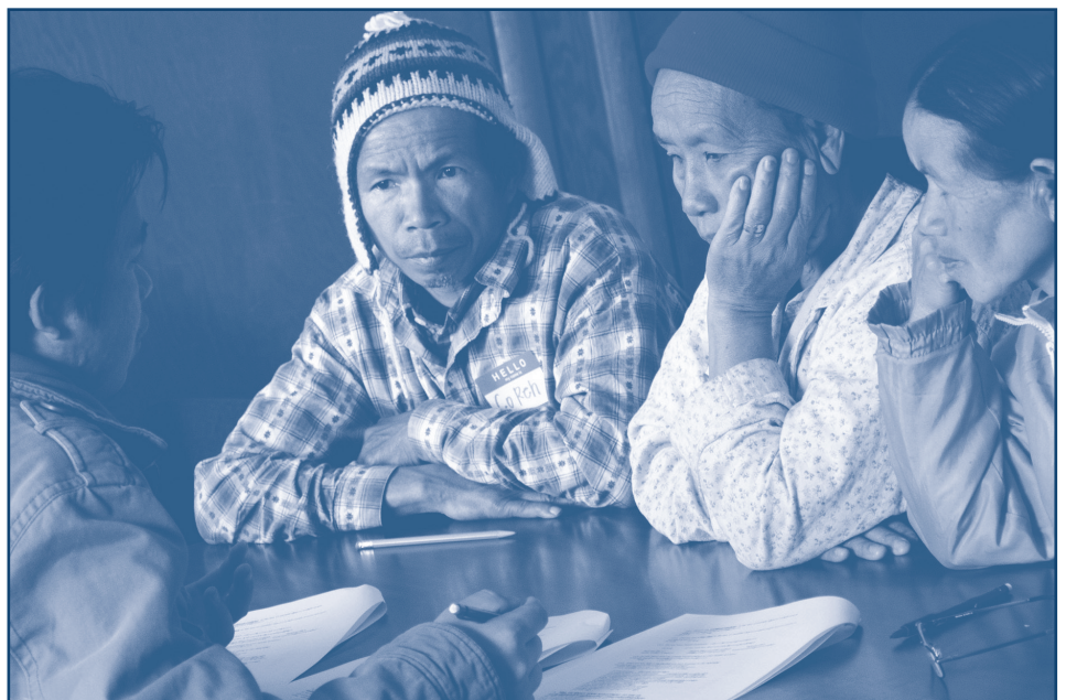
Burma Refugee Family Network (BRFN)