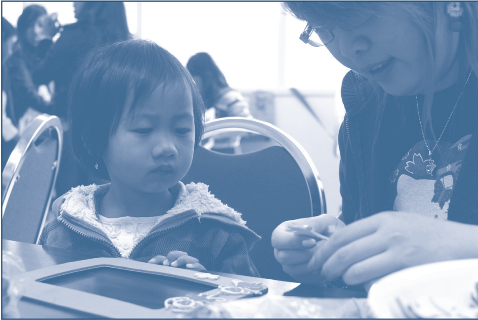
A girl learns how to make arts and crafts at a Burmese community center.