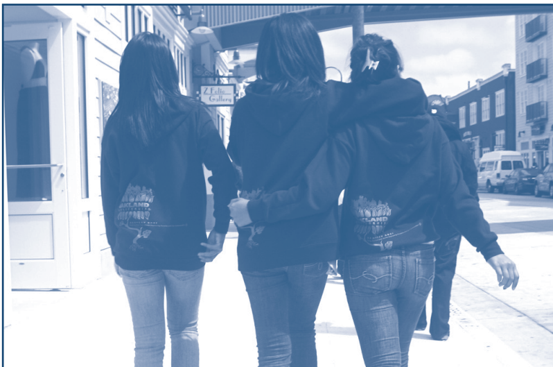
Banteay Srei members on a field trip